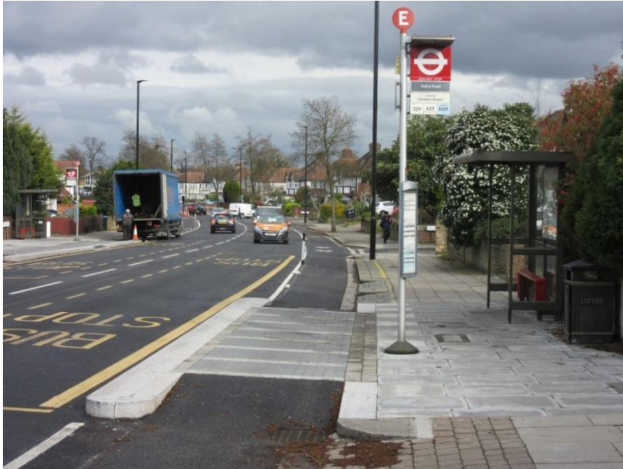
Figure 14. Shared bus boarder in Enfield