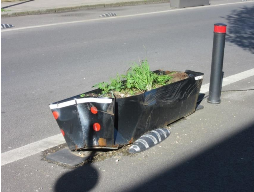
Figure 8. Damaged planter