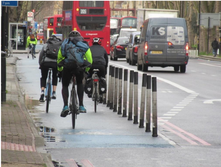
Figure 11. Flexible post segregation