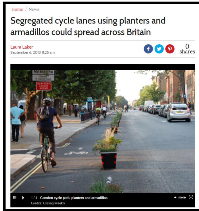
Figure 2. News article from Cycling Weekly in UK