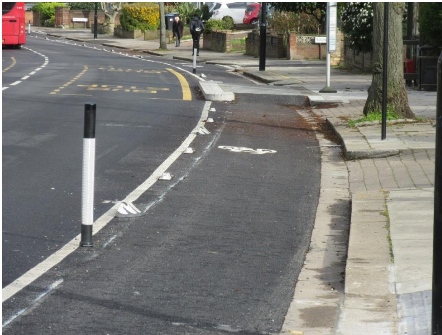
Figure 13. Combination of light protection objects past crossovers

Figure 13 shows how a combination of light segregation objects was used to achieve this end. A vertical and visible post was used at the start of a run, to warn other road users about the obstructions and these were followed by larger low-level units. When driveway access was required a smaller low-level unit was utilised so that vehicles could comfortably pass over them. These smaller units kept up the repetition of the larger objects and effectively deterred incursion from passing motor traffic.