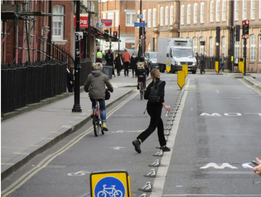
Figure 10. Pedestrian crossing light separation