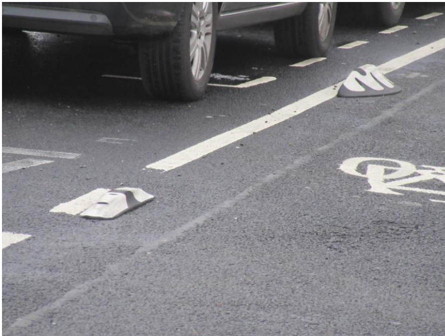
Figure 3. Light protection separating a cycle lane

The London Cycling Design Standards (LCDS) (Transport for London, 2014) defines light segregation as the use of physical objects intermittently placed alongside a cycle lane marking to give additional protection from motorised traffic. Figure 3 shows this approach on a cycle lane.