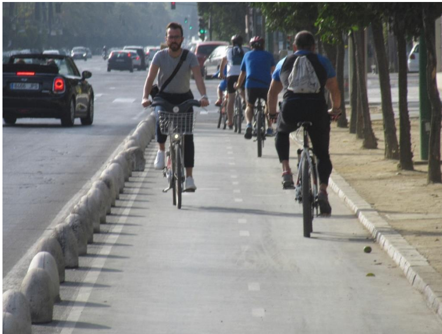
Figure 5. Light segregation in Seville

Several cities that have achieved significant recent increases in the number of people cycling have used light segregation to protect cycle lanes. Transport for London's (TfL's) International Cycling Infrastructure Best Practice Study includes case studies on infrastructure in New York, Washington D.C., Christchurch and Seville, all of which use forms of light segregation (Transport for London, 2013). Use of light segregation helped Seville to deliver a 50-mile long segregated cycle network in four years. Figure 5 shows light segregation in Seville.