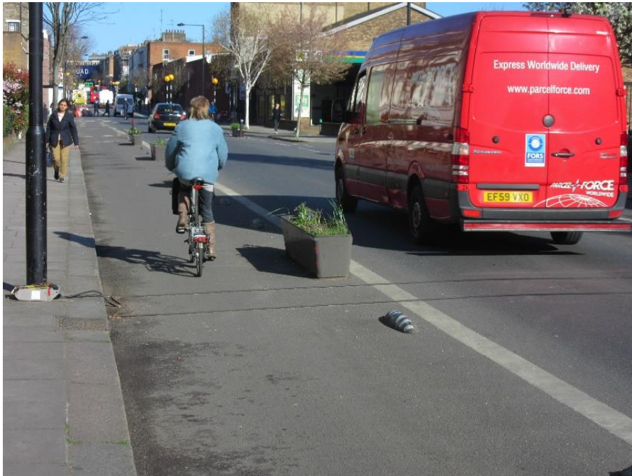
Figure 4. Planter and level segregation on Royal College Street

The Royal College Street scheme in Camden was monitored for 15 months after its implementation. During that period, the number of cyclists using the route increased by 70% and collisions reduced from 18 in the 15 months before the scheme to three in the 15 months after (Urban Movement, 2015). Figure 4 shows the protection offered by light segregation objects.