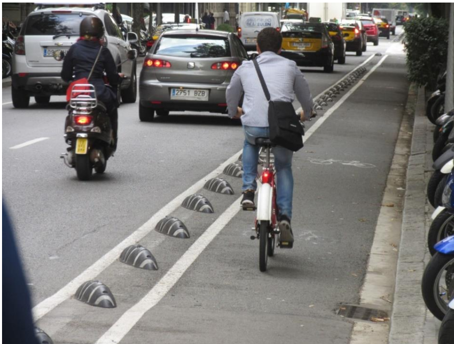
Figure 6. Zebra (armadillos) light segregation objects in Barcelona

Transport for London (TfL) commissioned the Transport Research Laboratory to investigate the impact of light segregation on the behaviour and safety of road users (Transport Research Laboratory, 2013). Two types of light segregation were used: Zicla 'Zebra 9' (armadillos) plastic bolt-on delineators spaced at 2.5m intervals and 1m-high Jislon flexible posts (wands) at 2m intervals. These were compared to 365mm-wide kerb segregation and a mandatory cycle lane marking. The trial measured the distance from each type of separation that cyclists and motorists feel comfortable keeping and explored the participants' general feelings about safety with each type. Figure 6 shows Zicla zebras in Barcelona.