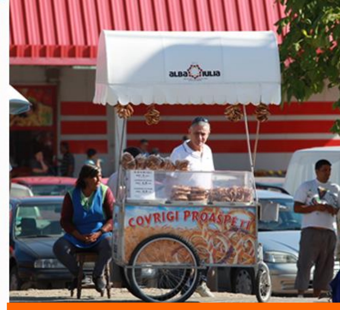
Bike based vendors