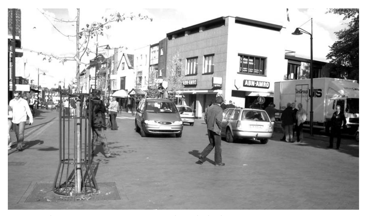
Figure 8. Rijksstraatweg, Haren, near Gronigen, The Netherlands.

streets. In 2002 the main shopping street in the suburban town of Haren, near Groningen, was redesigned along shared space principles. The 800 metre-long Rijksstraatweg carries between 8,500 and 12,000 vehicles per day through the main shopping and civic area. The former centre-line road markings, traffic signals, separate bicycle lanes and high kerbs were all removed. In their place, a simple 6 metre-wide carriageway links two major civic spaces where the former carriageway becomes an integral part of the surrounding public spaces. The position of trees blurs the distinction between road and public realm, and simple drainage details and low kerbs suggest subtle demarcations. Despite traffic speeds falling by around 5 km/h, the local bus company reports more reliable journey times. Pedestrians criss-cross the street amongst the passing traffic as the social life of the adjacent cafés and shops merges seamlessly with the street.