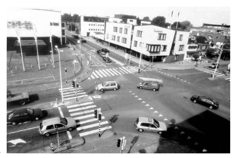
Figure 9. Laweiplein intersection, Drachten – before.

The Laweiplein example challenges many long-standing assumptions concerning the ability of people, whether drivers, bicyclists or pedestrians, to resolve potential conflict through informal protocols and human interaction prompted by clues from the built environment. Freed from the conventional regulatory framework of traffic-signals and rights-of-way, all the various participants in the constantly moving dynamic of the space appear to adopt a remarkable range of anticipatory and communication skills. The smooth flow of traffic and its interaction with cyclists and pedestrians prompts comparison with the ice-skating rink. It is a dynamic that appears difficult to predict or model, and indeed all the formal capacity engineering models<sup>5</sup> for the Laweiplein proved wildly inaccurate. No evidence could be found from video analysis and observations, or from questionnaires, that non-local drivers were unable to respond to the spatial clues. There are, to date, few indications that the civility, patience and courtesy engendered by the new arrangements diminish with time. The number of visits to the junction by professionals and journalists from around the world suggest that the outcomes of