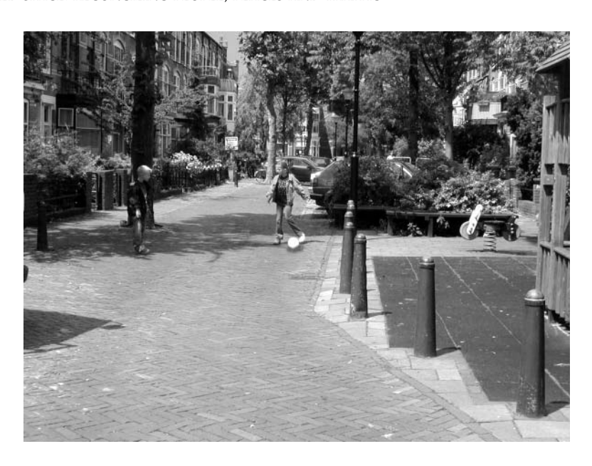
Figure 4. Integrated streets – early woonerf , Rijswijk, The Netherlands.

in the concept (Vahl and Giskes, 1990). In 1976 the Dutch government recognized and formalized the approach, defining the concept of the woonerf (roughly translated as 'yard for living') as a means to design low speed residential roads.