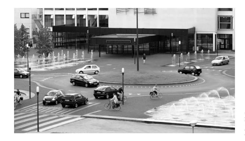
Figure 11. Laweiplein, Drachten. Traffic as integral part of a public square – after.

this counter-intuitive scheme may have profound implications for wider urban traffic engineering and the design of public space across other parts of the world.<sup>6</sup>