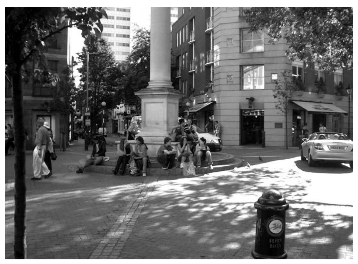
Figure 17. Seven Dials, Covent Garden. Perfect integration of traffic with the public realm.

by the examples from Britain and mainland Europe demand a fundamental reconsideration of many long-standing assumptions about traffic in towns, and represent a seachange in our approach to street design, traffic planning and the opportunities for a public realm. It is an approach that is still in its infancy, and there remain many barriers to overcome, observations to be made, evaluations to be conducted and experience to be gained. Questions remain as to what extent shared space can help resolve busier streets and intersections. Creativity and development is required to improve perceptions of safety and navigational aids for the visually impaired. The relationship between visual clues (such as apparent road widths, signs, kerbs and road markings) and driver behaviour remains little understood. Nevertheless shared space opens up a whole