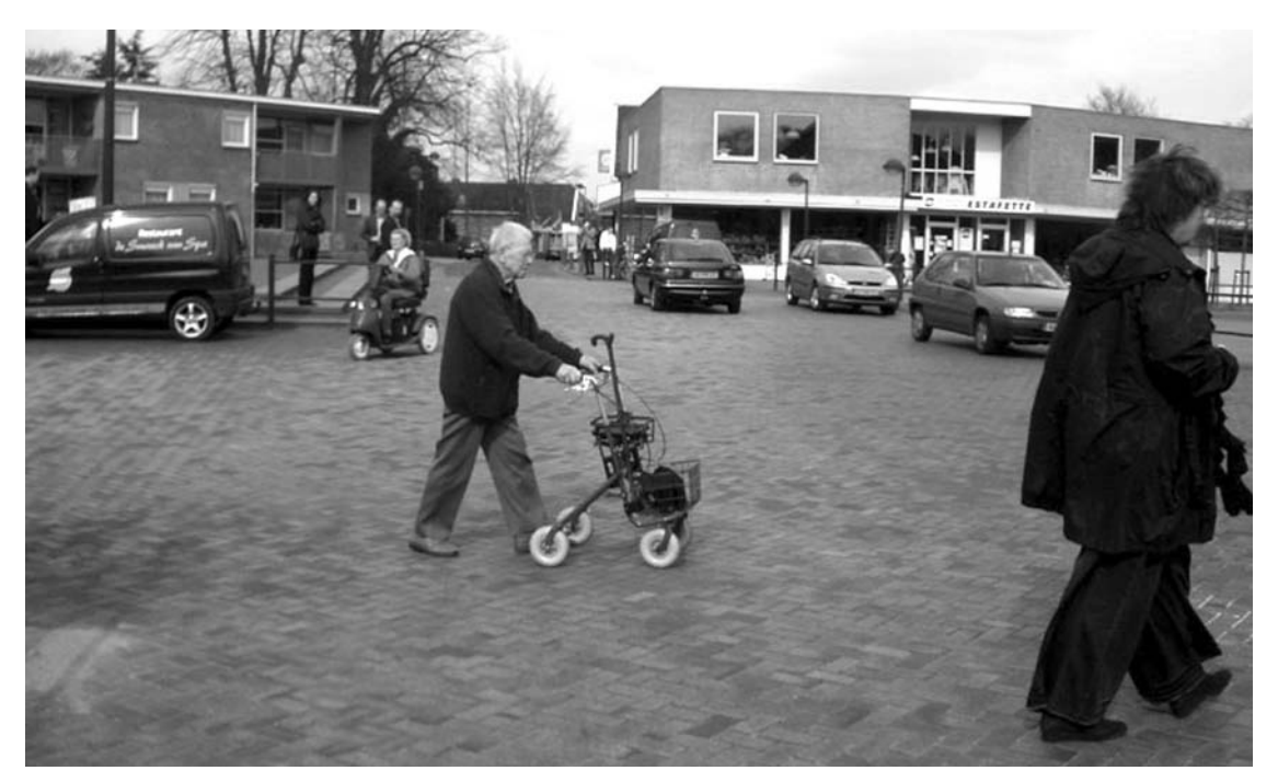
Figure 7. De Brink, Oosterwolde, The Netherlands.

The few professionals and journalists from outside the region who noticed these smaller schemes during the 1990s tended to assume that such informal traffic arrangements could only function in small, homogeneous villages and market towns. Many also assumed that foreigners, not familiar with local protocols, might not respond as locals do. But more recent schemes have begun to indicate that shared space principles, the integration of traffic into the social and cultural fabric of the built environment, might be suitable for busier town centre intersections and high