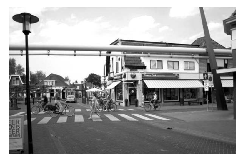
Figure 6. Wolvega, Friesland. Remodelled intersection of High Street and main road.

Monderman's pioneering schemes gave increasing confidence to the idea that road signs and markings, signals and barriers were not essential requirements for safe and efficient traffic movement. Indeed the reductions in speeds and concurrent decline in the severity of accidents seemed to point to a closer relationship between safe traffic movement and the distinctive spatial quality of streets and spaces. Subsequent schemes