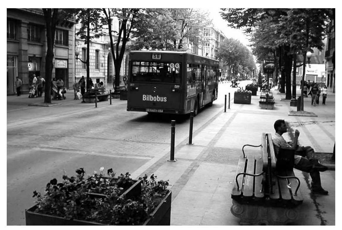
Figure 12. Gran Via, Bilbao.

In the Swedish university town of Norrköping, south-west of Stockholm, a major intersection near the town centre known as Skvallertorget (Gossip Square) provides a striking demonstration of the opportunities presented by shared space design principles. Formerly a traffic-signal controlled intersection in a bleak and under-valued urban setting, the space was remodelled in 2004 in response to the relocation of a university faculty close to the square. To help reconnect the space with the city centre and to cope with the increasing volume of student cyclists