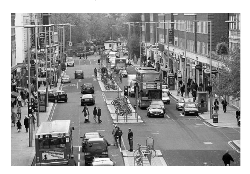
Figure 15. Kensington High Street, West London.

a comprehensive streetscape design guide (RBKC, 2005) which codifies many of the key principles of shared space under the heading 'Barrier-free Design'. More ambitious proposals are in preparation for Exhibition Road in Kensington, intended to permit traffic to continue to move through a linear public space that responds to the richly varied cultural context of this much-visited street.