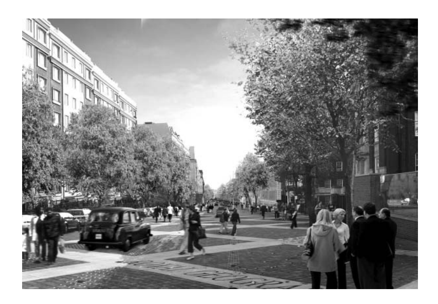
Figure 16. Proposals for Exhibition Road. ( Illustration : RBKC)

test of time, can be found in the heart of London's Covent Garden. As a result of the tireless efforts of the Seven Dials Monument Trust, the restoration of Seven Dials in the early 1990s not only restored a distinctive historic monument to one of London's most memorable spaces, but created a perfect demonstration of the potential for a busy junction to operate without formal controls, signage or regulation. The base of the restored sundial serves to attract much human activity at the focal point of