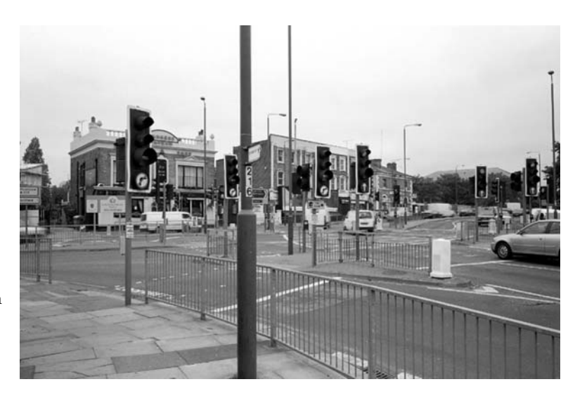
Figure 1. Regulation and segregation in the public realm and the resulting clutter – the junction of Kew Road and Chiswick High Road.

Firstly there is the issue of safety. Although there is growing awareness of the complexities of safety and the difficulties in adequately defining the term, most governments assume at least partial responsibility for reducing the numbers of deaths and injuries. Although overall numbers of road casualties are falling, and the UK compares well to other European countries in terms of road deaths and injuries, such reductions are not evenly distributed. Pedestrian casualties remain high, especially amongst children (IPPR, 2002). Children in poorer neighbourhoods fare particularly badly. Road safety, and the desire to reduce casualties, remains an important motive for improving street design.