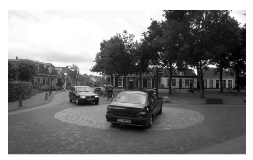
Figure 5. Makkinga, Friesland. All traffic signs, signals and markings removed.

to his own astonishment, Monderman recorded reductions in traffic speeds of over 40 per cent (conventional traffic calming was achieving reductions closer to 10 per cent). Further successful village schemes followed, recording dramatic reductions in speeds and the severity of accidents.<sup>3</sup> In 1992 the village of Makkinga became the first small town to remove every standard road sign, signal and road marking. In their place, the new street designs paid close attention to the particular landmarks and preferred pedestrian routes ('desire lines'<sup>4</sup>) of the community, emphasizing links between school, shop, church and village green, and even reflecting the canopy