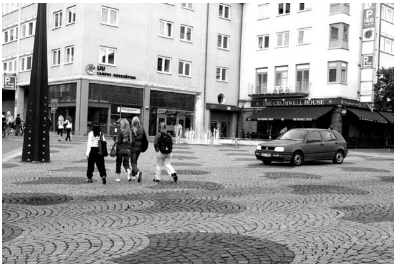
Figure 13. Skvallertorget, Norrköping, Sweden before and after remodelling of the intersection.

and pedestrians, the whole intersection has been treated as a single, coherent plaza where all suggestion of priorities or linear emphasis has been removed. The signals are gone. In their place, a distinctive paving pattern reinforces the spatial qualities; lighting columns are placed, unprotected by kerbs, wherever needed. A clear boundary around the square of contrasting material helps define the space and offers some tactile and visual guidance.