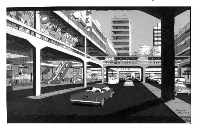
Figure 3. Segregation of traffic from civic spaces. ( Source : Buchanan et al. , 1963)

Segregation of traffic from other aspects of urban life matched the zeitgeist of 1960s