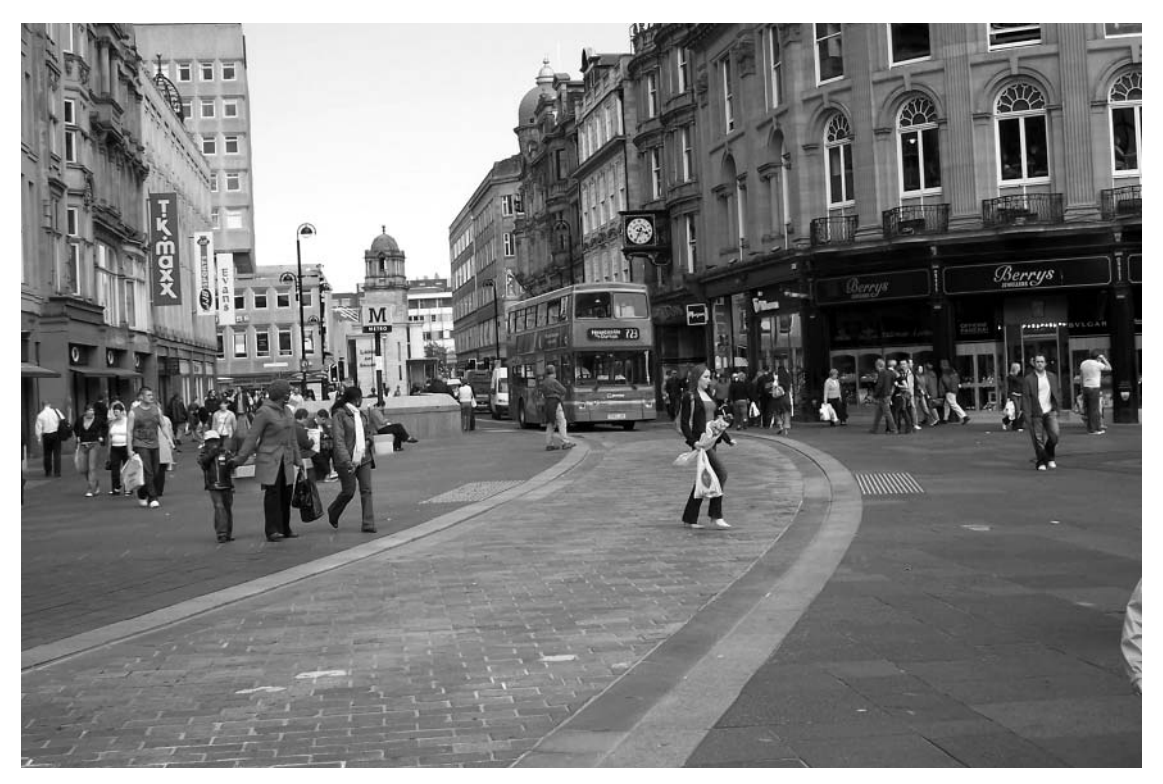
Figure 14. Blackett Street, Newcastle.

The success of Kensington High Street has prompted the Royal Borough to produce